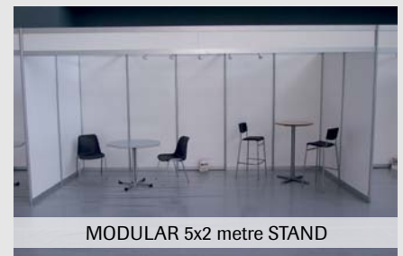
MODULAR 5x2 metre STAND