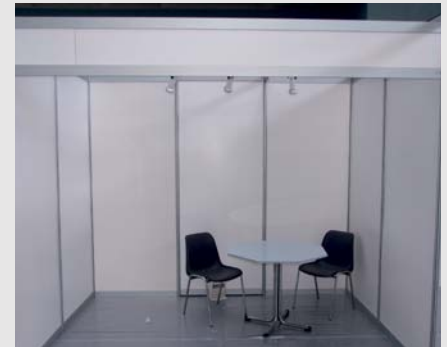
MODULAR 3x2 metre STAND