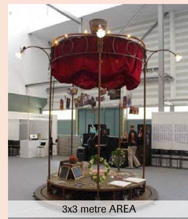
3x3 metre AREA