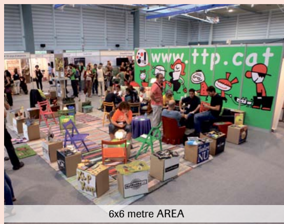
6x6 metre AREA