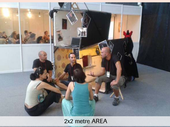
2x2 metre AREA