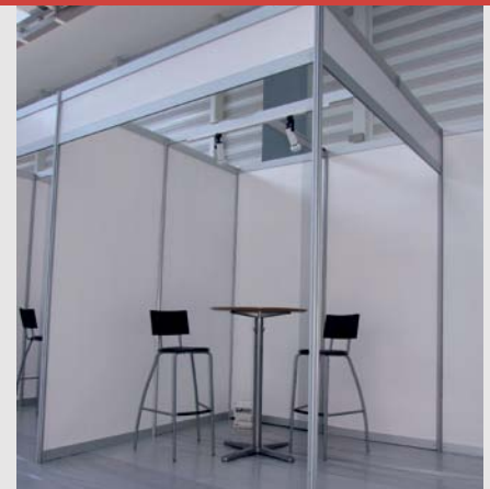
MODULAR 2x2 metre CORNER STAND